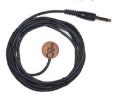
AT-1 - 10' cable with 1/4" plug AT-1S - 2' cable with strap pin jack

Designed to pick up vibrations from any acoustic soundboard be it on a classical guitar, violin, harp or even a piano. The AT-1 can be used as the sole pickup or to augment built in pickup systems. All musicians would benefit from having one or more of these stick-on pickups as they are handy and useful tool and can get you out of a jam when the battery in an on board system decides to die. There are two cable options for added flexibility: